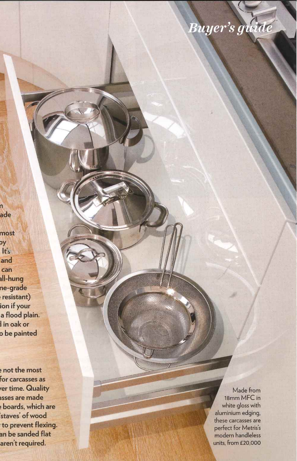
Made from 18mm MFC in white gloss with aluminium edging, these carcasses are perfect for Metris's modern handleless units, from £20,000

SOLID WOOD Single planks are not the most practical choice for carcasses as they can warp over time. Quality solid-wood carcasses are made from multi-stave boards, which are narrow strips or 'staves' of wood jointed together to prevent flexing. Carcass edges can be sanded flat so edging strips aren't required.