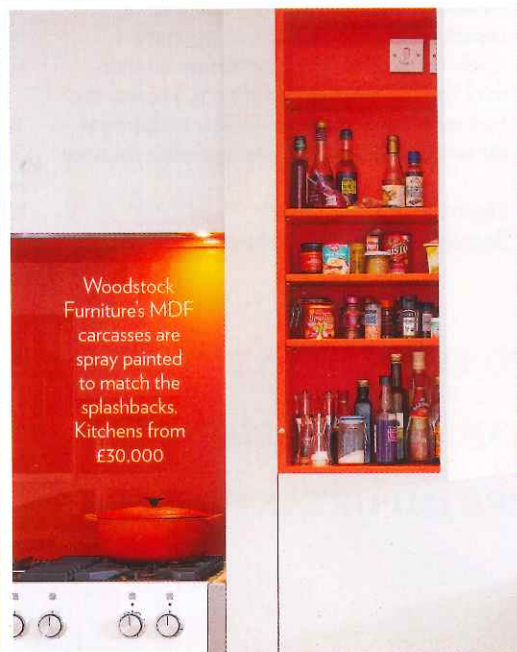
Woodstock Furniture's MDF carcasses are spray painted to match the splashbacks. Kitchens from £30,000