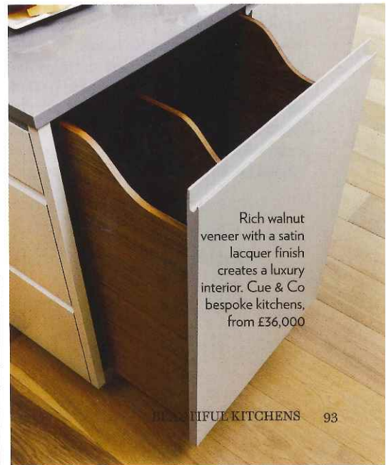
Rich walnut veneer with a satin lacquer finish creates a luxury interior. Cue & Co bespoke kitchens, from £36,000