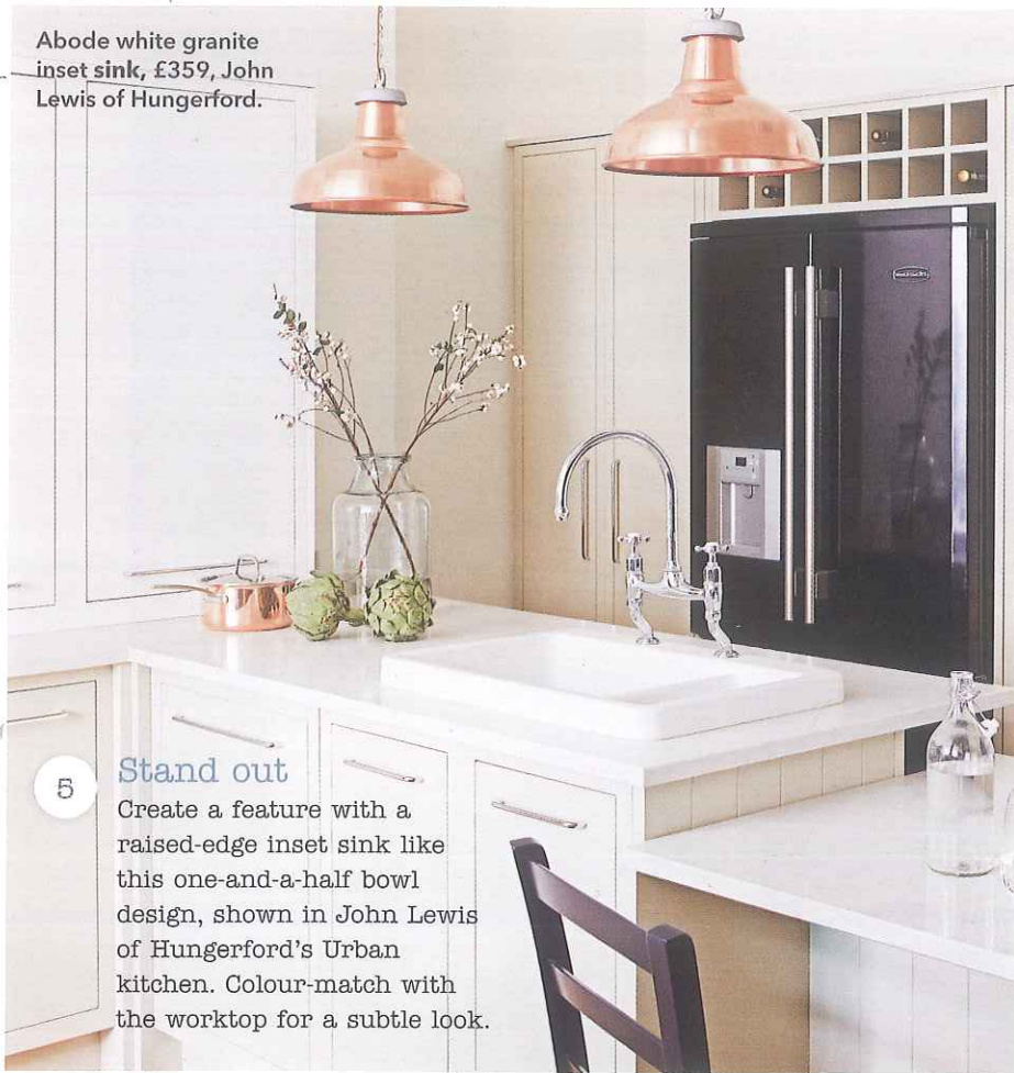
Abode white granite inset sink, £359, John Lewis of Hungerford.